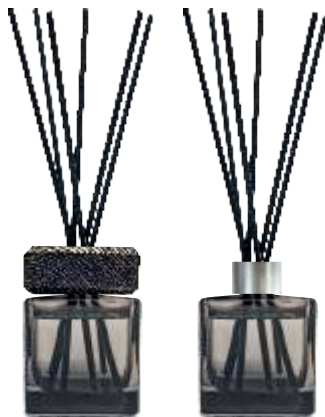
PREMIUM SQUARE diffuser